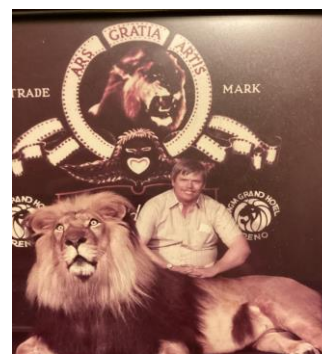
MGM Lion in Las Vegas