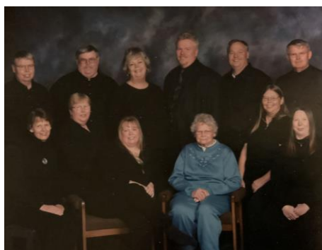
Mom and Siblings